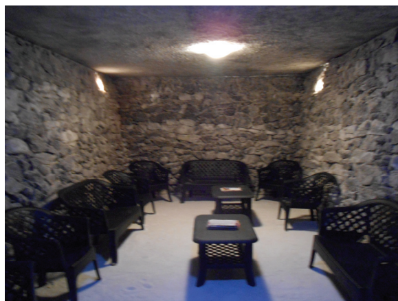
Fig. 1 Halotherapy chamber with artificial salt-mine environment” of INRMFB, Bucharest, 11A, Ion Mihalache Blvd.

When patients for the experimental HT treatment were selected, 18 patients were investigated (16 adults and 2 infants with ages between 6–13 years) with bronchial asthma and chronic bronchitis, chronic obstructive bronchopneumopathy, of whom 14 had bronchial asthma with therapeutic control and partial control (atopic - 2, mixed-12; moderate - 2), also suffering from other pathologies like allergic rhinitis (including moderate persistence), rhinosinusitis, respiratory virosis, viral post-pneumonia condition, chronic gastritis, duodenal ulcer, ischemic coronary disease, light mitral failure, atopic dermatitis, chronic bronchitis, hypertensive cardiomyopathy, HTAE 1-2 degree, lumbar discopathy, cervical spondylosis, osteoporosis, hypothyreosis, hemorrhoid disease, dyslipidemia, obesity III degree, urinary infection; 4 patients with chronic bronchitis or chronic obstructive bronchopneumopathy (II and III) with acute exacerbation of GOLD (1 case), showing arrhythmia, tachycardia, dyslipidemia. Subsequently, all the patients underwent medical-biological investigations.